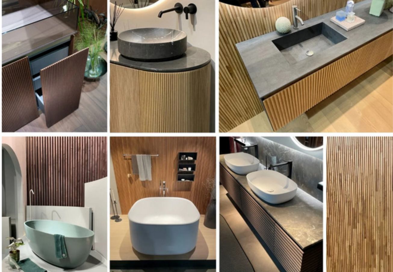
Salone Fluted Timber Trend