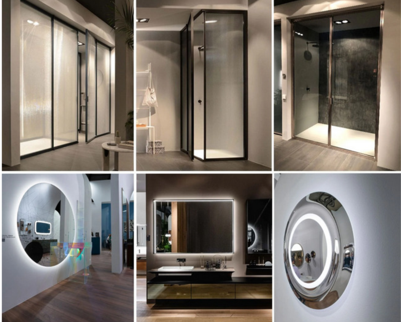
Salone Oversized Mirrors Trend