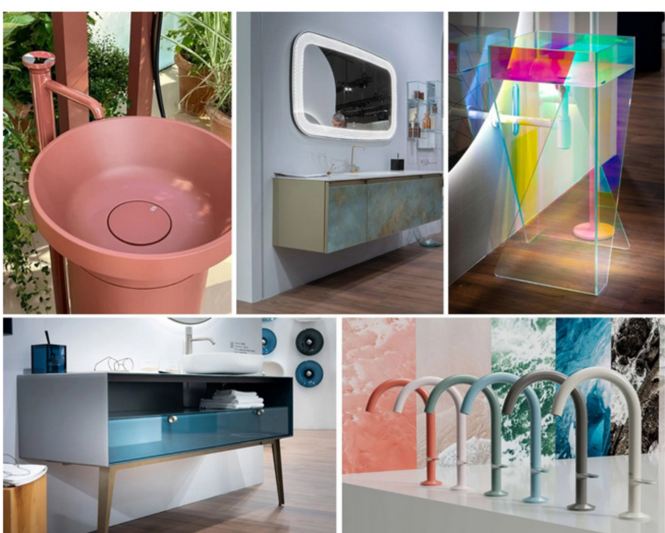
Salone Retro Revival Trend